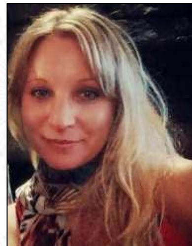
Lize Loots Sexual Violence Research Initiative