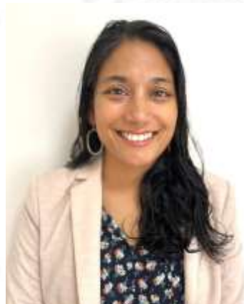
Sunita Caminha UN Women